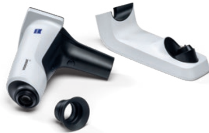
The ZEISS VISUSCOUT 100: flexible and mobile fundus imaging