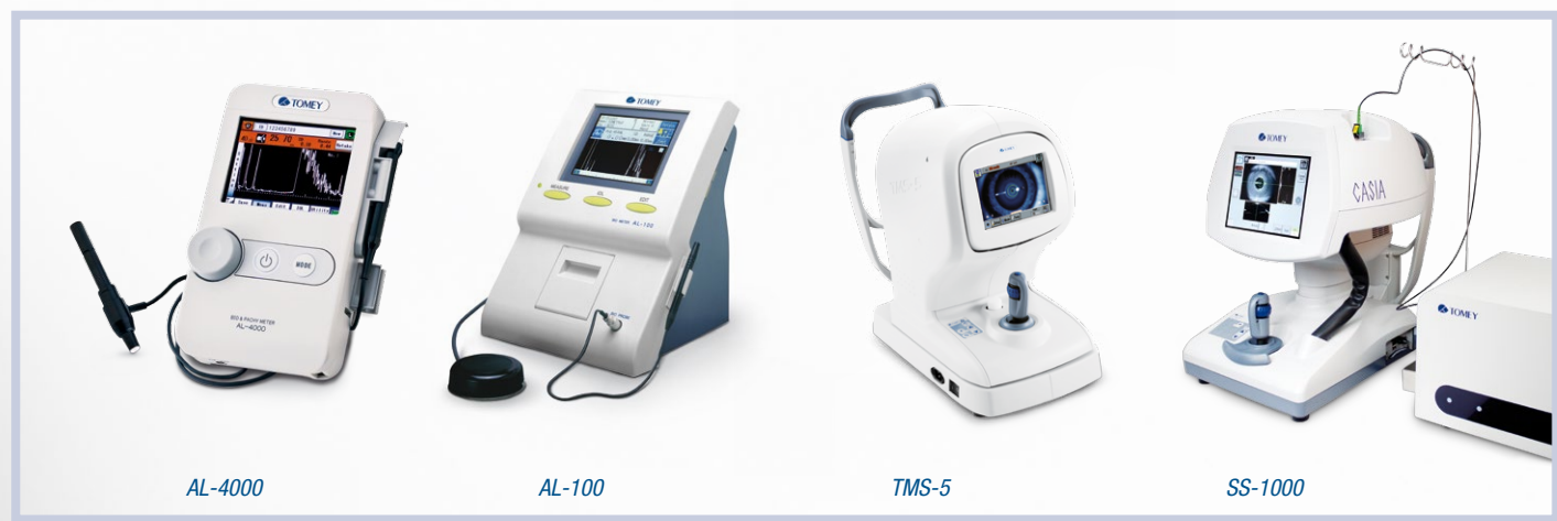
OA-2000 communicates with OCT SS-1000, Bio-/Pachymeter AL-4000, A-scan/Biometer AL-100 and Scheimpflug TMS-5.

2017/08 - subject to change without notice