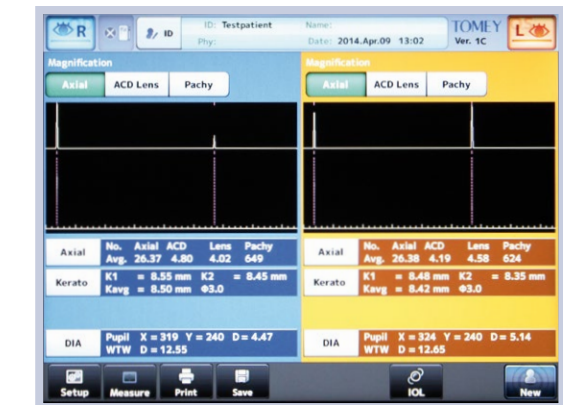
Measurement screen dual view

A video says more than a thousand words – just scan this QR-Code.