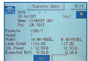
Comfortable data transfer to memory card or RS-232 port

2018/05 - subject to change without notice