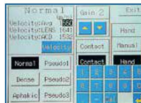
The AL-100 provides full access to ultrasound velocities